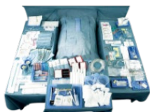
Full Set Kit