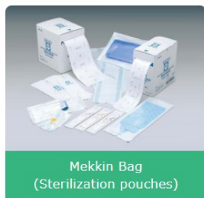
Mekkin Bag (Sterilization pouches)