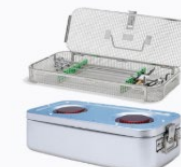
Sterilization container Easy Fit System