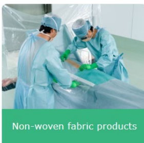
Non-woven fabric products